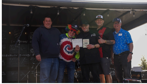
1 st Place Professional Chowder Big Lake Bar & Grill