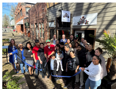
Ribbon Cutting at Mister Party LLC