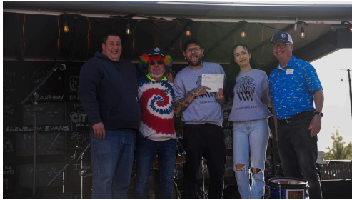
2 nd Place Professional Chili Whispering Willows of Mount Vernon