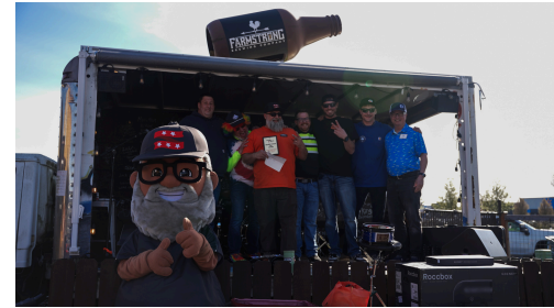
2 nd Place Amateur Chili Skagit Plumbing