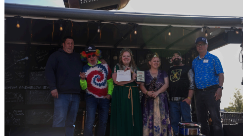
1 st Place Amateur Chowder and Best Decorated The Dragon's Ladle