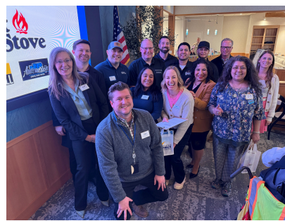
New Members at Town & Country Membership Luncheon