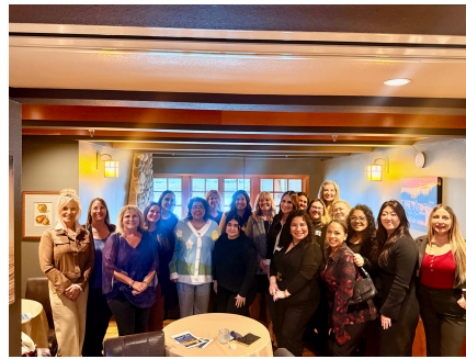
Speaking of Women "Insights from the Top"