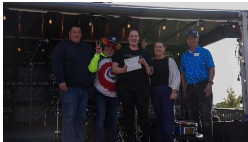
2 nd Place Professional Chowder The Skagit Table