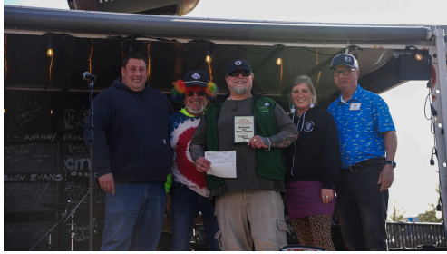
1 st Place Professional Chili Skagit Valley Food Co-op