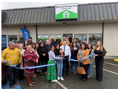
Ribbon Cutting at Alfa and Omega Tax Service