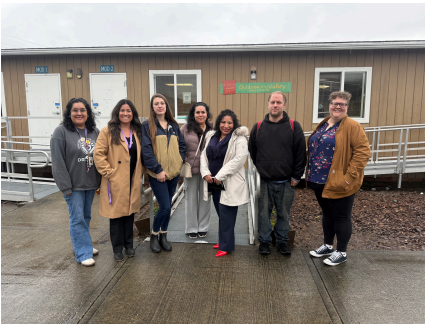
EWP Presentation at Children of the Valley After School Program