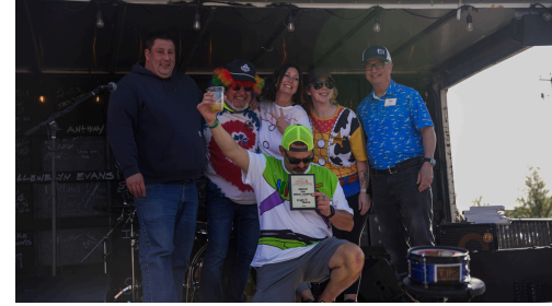
1 st Place Amateur Chili KAPS & KBRC Radio