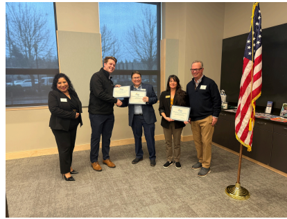
Renewing Members at the Membership Luncheon