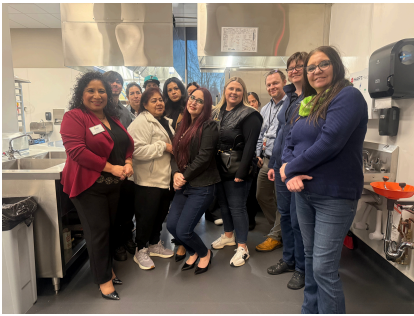
Food Service Training Day