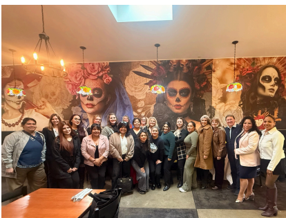
Speaking of Women Kickoff Breakfast