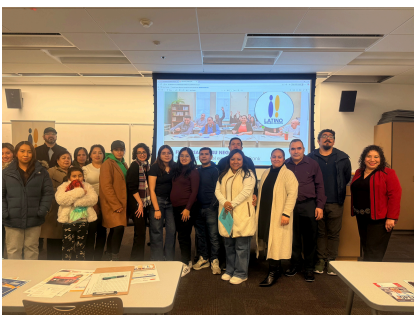
Latino Business Leaders Taxes 101 Class