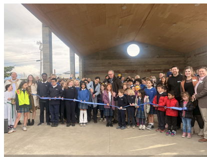
Ribbon Cutting at Immaculate Conception Regional School