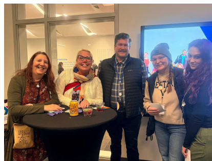
Multi-Chamber After Hours at Skagit Valley Family YMCA