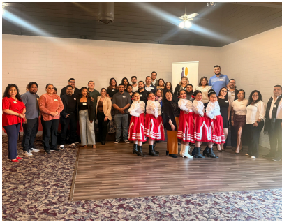
Latino Business Leaders Spring Social