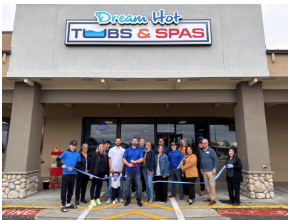
Ribbon Cutting at Dream Hot Tubs and Spas