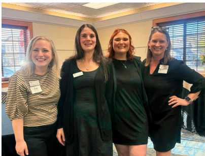
Multi-Chamber After Hours at The La Conner Inn