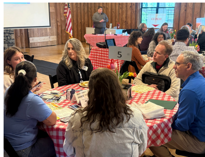
Biz Buzz Networking Luncheon