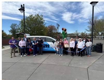
Ribbon Cutting for Way Maker Personal Care Transportation