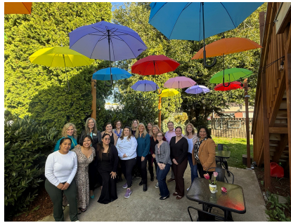
Speaking of Women Coffee Chat